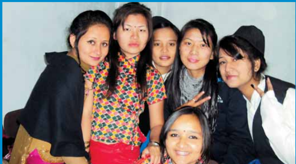
Students of CDS 3rd Year During Welcome & Farewell Program