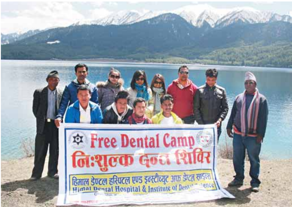
Free Dental Camp at Mugu (RARA) District