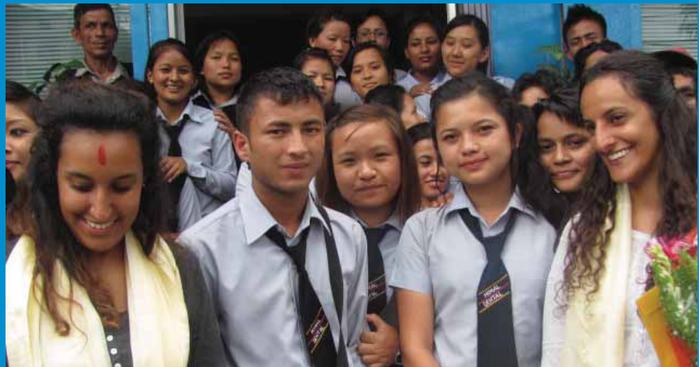
Students of CDS 3rd Year with Foreigner Doctors