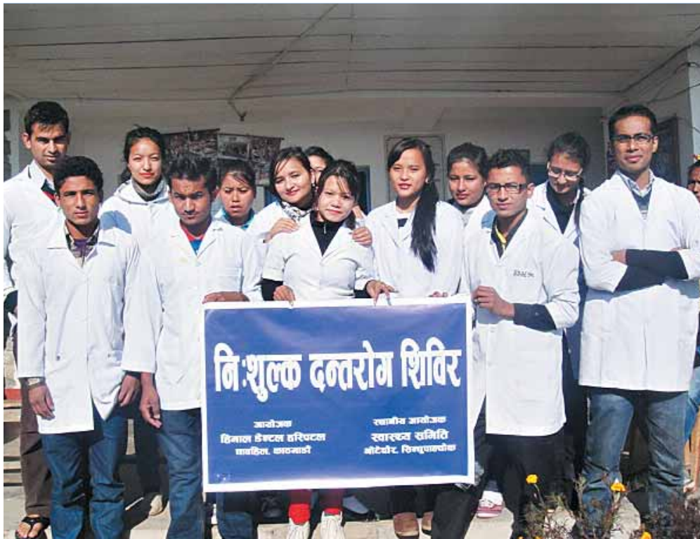
Free Dental Camp Organized by Himlal Dental Hospital